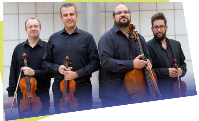
AENAON string quartet

Formed by four distinguished members of the Athens State Orchestra, the AENAON String Quartet explores the rich and diverse repertoire written for string quartet. Through refined counterpoint and interpretive depth, the ensemble highlights the unique voice of each instrument while striving for musical unity—always guided by the composer's vision as they perceive it.